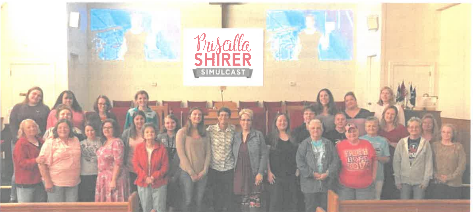
Twenty-eight women gathered for an intergenerational night of worship, study, discussion and dinner enjoying the teaching of Priscilla Shirer through the technology of a web based nationwide simulcast of her live event in Tulsa, Oklahoma.